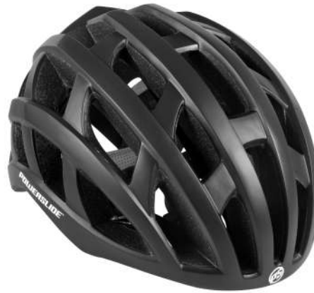
FITNESS STYLE HELMET