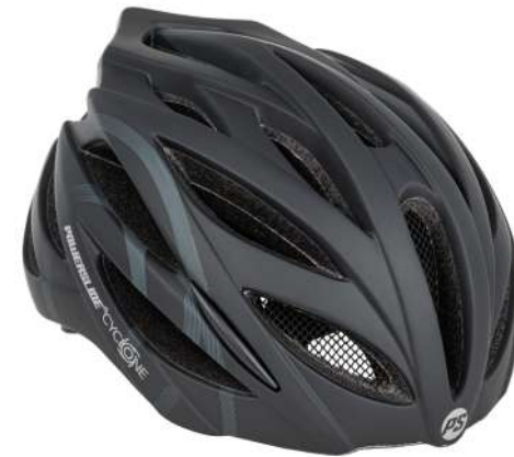
RACING STYLE HELMET