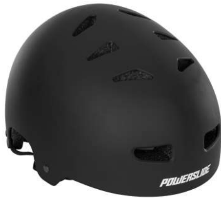
URBAN STYLE HELMET

POWERSLIDE offers a range of high-quality helmets designed for all types of skating – kids, urban, aggressive, SUV and race. All of our helmets provide superb safety and security while giving you options to match your helmet to your skating style.